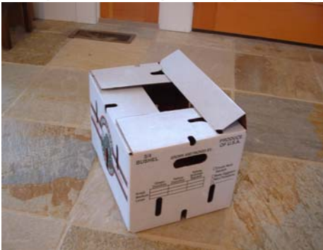
New Box from top (above) from bottom (pictured right)